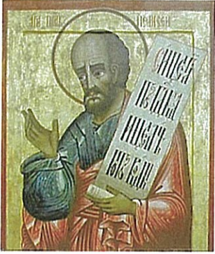
The Prophet Elisha - June 14

Cognizant of its origin on Mount Carmel, the Carmelites desired to perpetuate the memory of the great prophets' presence and deeds through liturgical celebration of Sts Elijah and his disciple and protégé Elisha. The General Chapter of 1399 decreed the celebration of the feast of St. Elisha. "Elijah came upon Elisha and threw his cloak over him. Immediately Elisha left the oxen and ran after Elijah as his attendant." Elisha was filled with the double portion of the spirit of Elijah, literally performing double the miracles attributed to Elijah. He cured Naaman of leprosy and raised a dead child to life, and purified the waters of the spring in Jericho to make it drinkable. He led the sons of the prophets on Mount Carmel and in God's name he frequently intervened in the affairs of the Israelites. Through his fidelity to the true God and by his service to God's people St. Elisha demonstrate the meaning of the prophetic office.