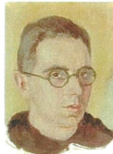
Bl. Hilary Januszewski June 12

He was beatified by John Paul II on June 13, 1999 along with other Polish martyrs.