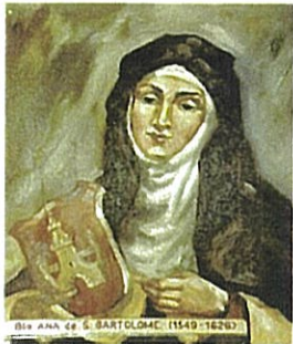
Bl. Anne of St. Bartholomew June 7

Cognizant of its origin on Mount Carmel, the Carmelites desired to perpetuate the memory of the great prophets' presence and deeds through liturgical celebration of Sts Elijah and his disciple and protégé Elisha. The General Chapter of 1399 decreed the celebration of the feast of St. Elisha. "Elijah came upon Elisha and threw his cloak over him. Immediately Elisha left the oxen and ran after Elijah as his attendant." Elisha was filled with the double portion of the spirit of Elijah, literally performing double the miracles attributed to Elijah. He cured Naaman of leprosy and raised a dead child to life, and purified the waters of the spring in Jericho to make it drinkable. He led the sons of the prophets on Mount Carmel and in God's name he frequently intervened in the affairs of the Israelites. Through his fidelity to the true God and by his service to God's people St. Elisha demonstrate the meaning of the prophetic office.